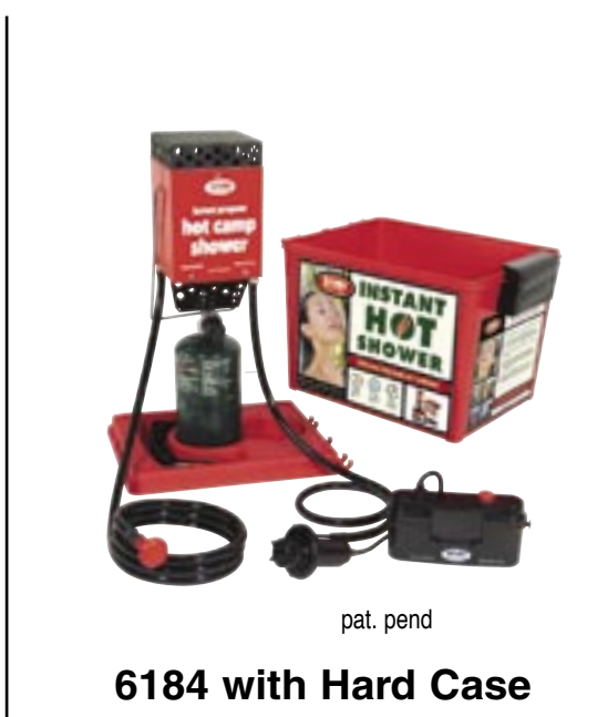
6184 with Hard Case 6185 with Piezo