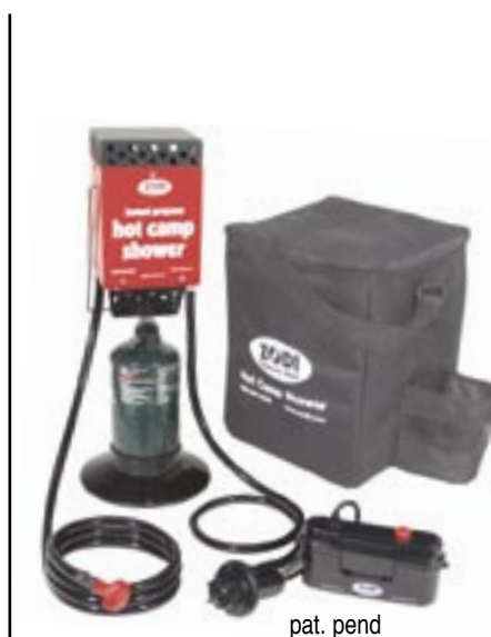
6183 with Soft Case